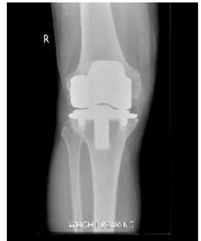
Knee Joint with Prosthesis Showing Bone Loss due to Osteolysis

Ocular Tissue Engineering Theme – to combat visual impairment such as cataract and presbyopia. To date we have studied the behaviour of lens capsule tissue and the behaviour of lens epithelial cells on 2D and 3D supports and such research areas are of growing importance to me. Building upon these achievements and deep interest, future aims include the delivery of a robust 3-D bioengineered immuno-compatible biodegradable biosupports and investigation of increasing base membrane permeability using chemical engineered drug delivery methods